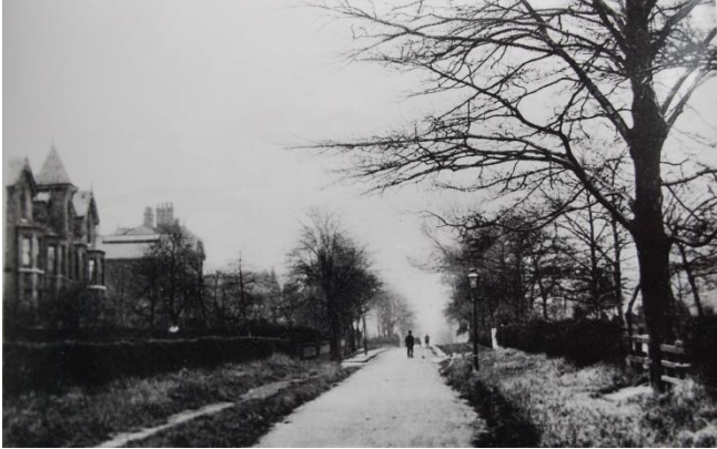
Stafford Road 1900

The terrace of three impressive Victorian houses on the left hand side in the Stafford Road 1900 photograph are fortunately still with us. From census records we can see that they were all occupied in 1886.