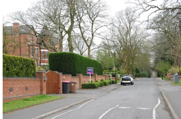
Stafford Road 2020