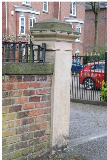
Gate Post at Ellesmere Lodge (previously Granville House)

The gate post is fairly distinctive and there is every chance this group are walking past Granville House, (now the site of the apartment complex called Ellesmere Lodge) towards Quaker Bridge. If this is the case, the house in the background is Stafford house. The gentleman standing just in the road appears to be by a driveway, which would be to Stafford House.