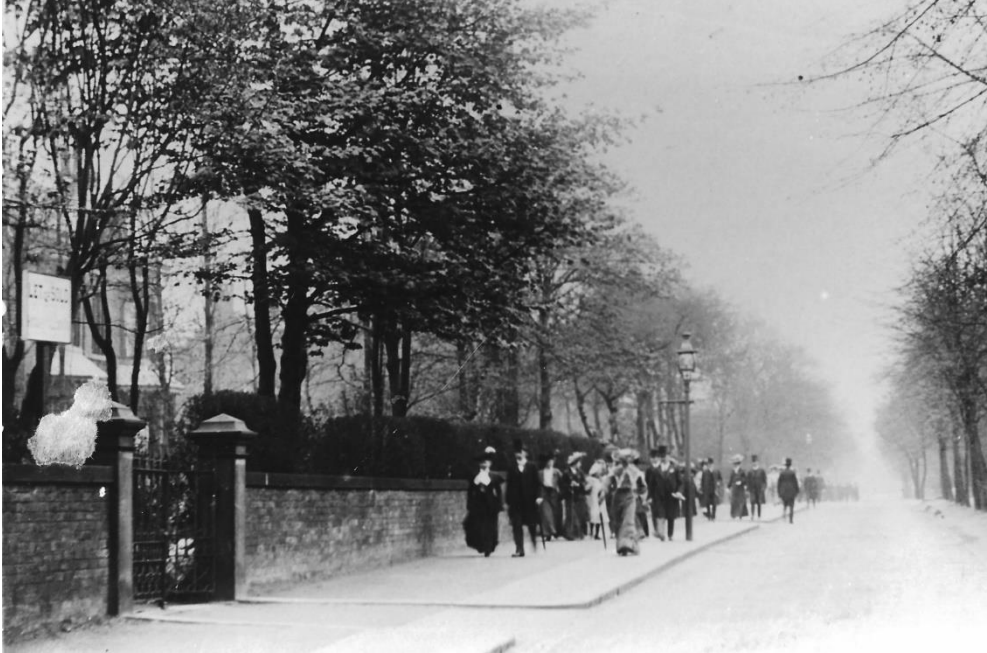
Ellesmere Road circa 1890

Here is another group of smart people walking along Ellesmere Road. Unfortunately we do not have a definitive date for the photograph but from the style of the top-hats it could be 1880-90.