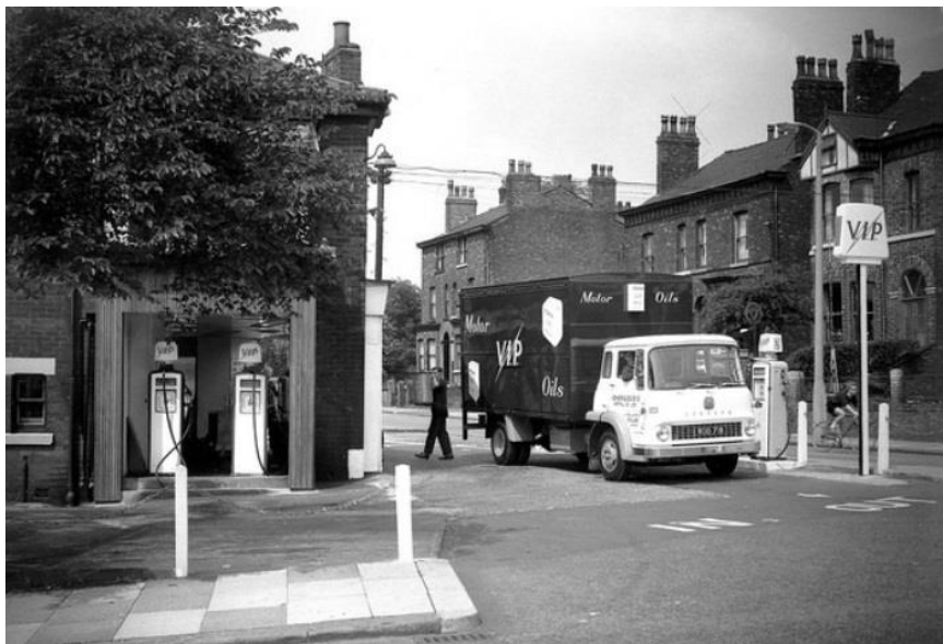
V.I.P. Garage on Wellington Road