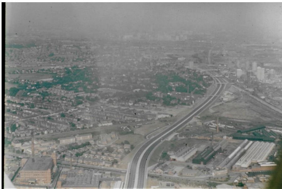
Aerial Photo M602 – 2

Aerial Photo M602 – 1 shows the new roundabout at Gilda Brook Road. In 1973 the M602 terminated at this junction, the extension to Regent Road in Salford came a few years later.