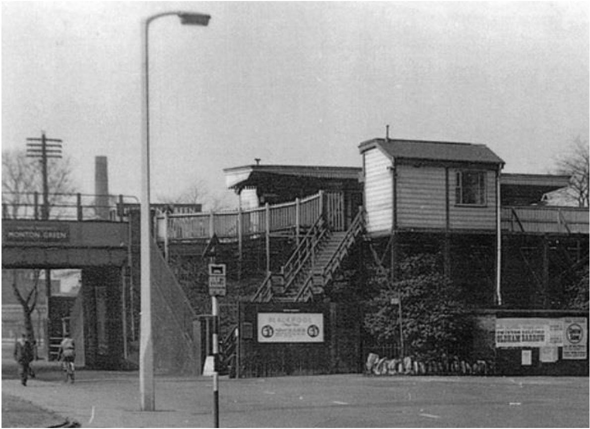
Monton Green Station and Bridge