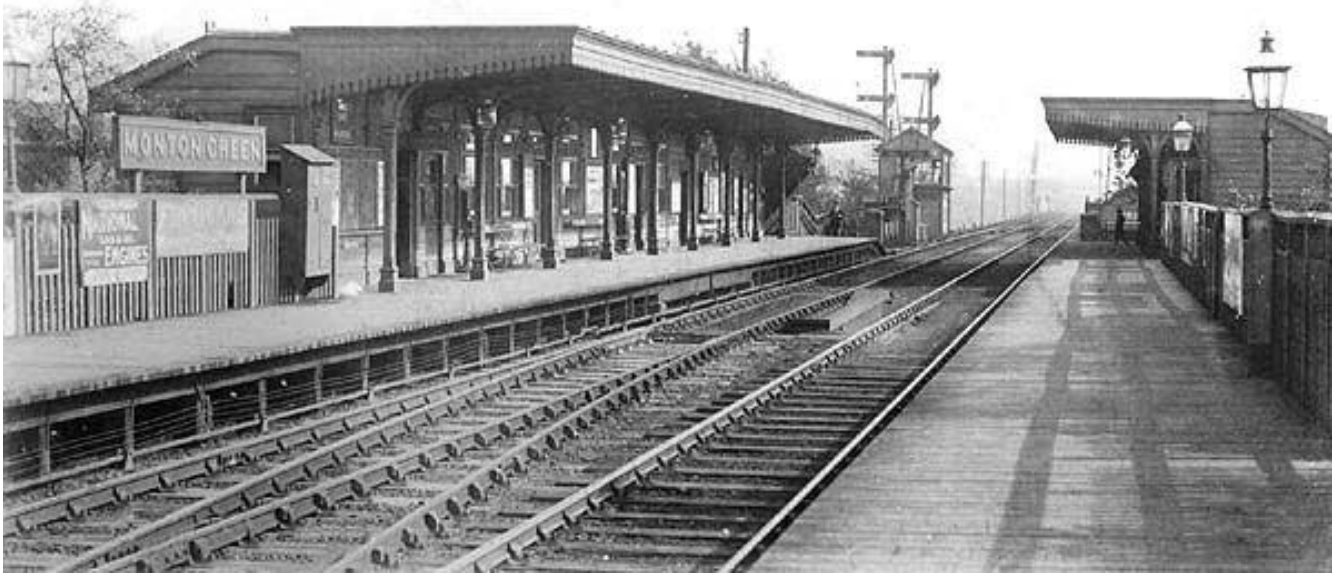
Monton Green Station Platform