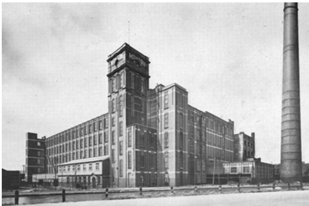
Monton Mill - 1927

has it that the chimney at this mill was demolished by the Bolton steeplejack, Fred Dibnah. If anyone knows for certain that this is true I would be interested to know.