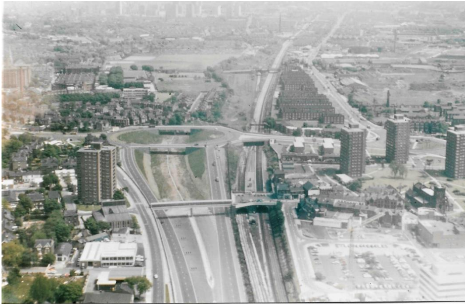
Aerial Photo M602 – 1

The two aerial photographs below are amateur photographs taken in 1973 of the partially built M602 motorway.