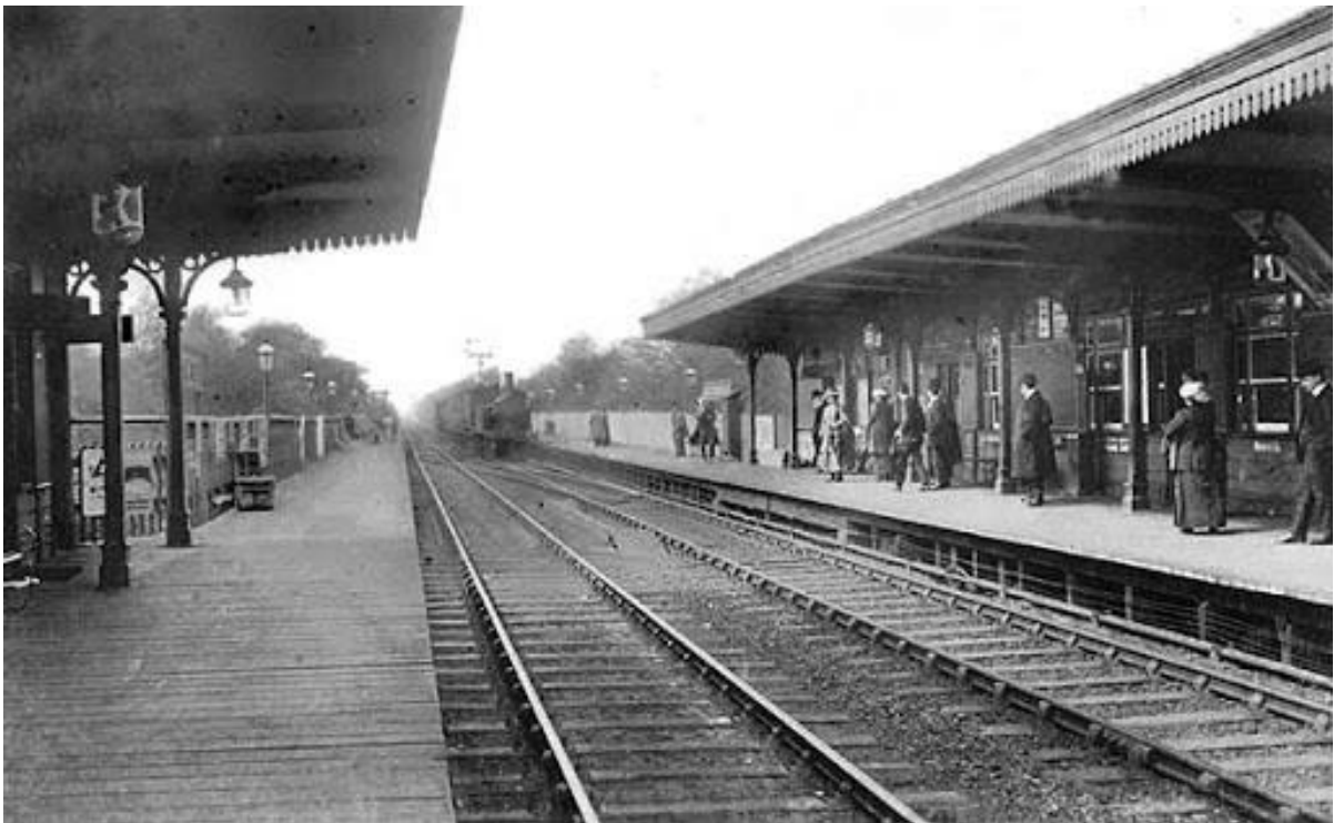
Monton Green Station Platform