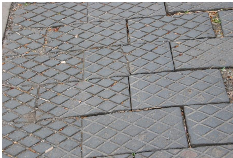
Victorian Paving Blocks

The paving blocks look similar to the paving blocks still found at the south-east end of Ellesmere Road as shown in the photograph below.