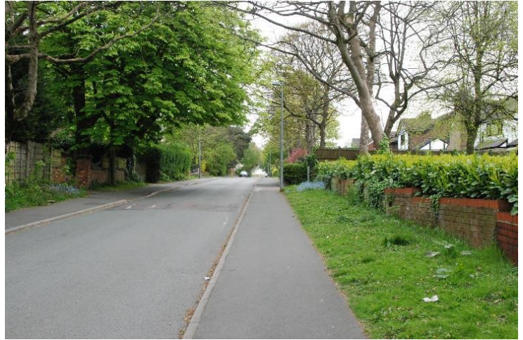
Cavendish Road – 2020'

In the photograph 'Cavendish Road – 2020' I attempted to achieve the same view as the 1961 photograph. The lampposts are in approximately the same positions; the gate would have been roughly where the speed hump is now located.