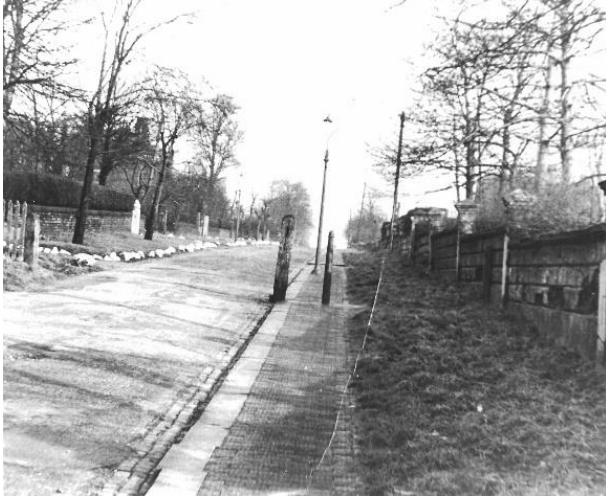
Cavendish Road – 1961

A very interesting photograph is 'Cavendish Road – 1961' which shows the remains of gate posts and fencing close to Monton Road. Although there was no traditional gate house on Cavendish Road, the map "Cavendish Road Map – 1893", clearly shows a line across Cavendish Road, adjacent to Monton House, which indicates a gate or fence. The significant wall on the right shows the boundary wall of Monton House.