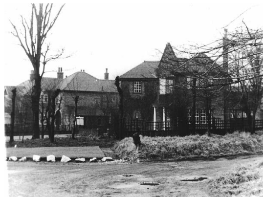
'Montrose' - 13 Cavendish Road