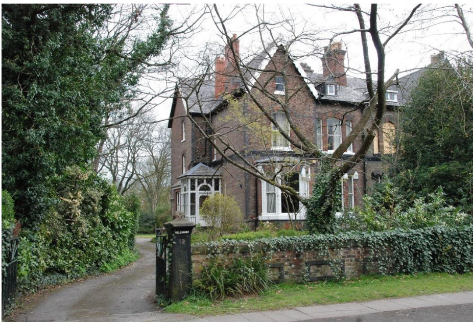
12 Ellesmere Road - Holcombe in 2020

I don't know how long it was used as a Tax Office but it was obviously established long enough for the Post-War Tax Credit Certificates to be printed with the Holcombe address. You may notice on the attached copy of a Certificate of Post-War Credit the house number '12' was not included in the address. Post-War Credit certificates were issued during the Second World War as recognition for the higher taxes paid by the public to support the war effort. The additional tax, plus interest, was repaid by 1973 to most of those who had retained their certificates.