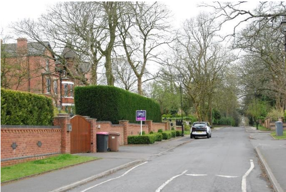
Stafford Road 2020