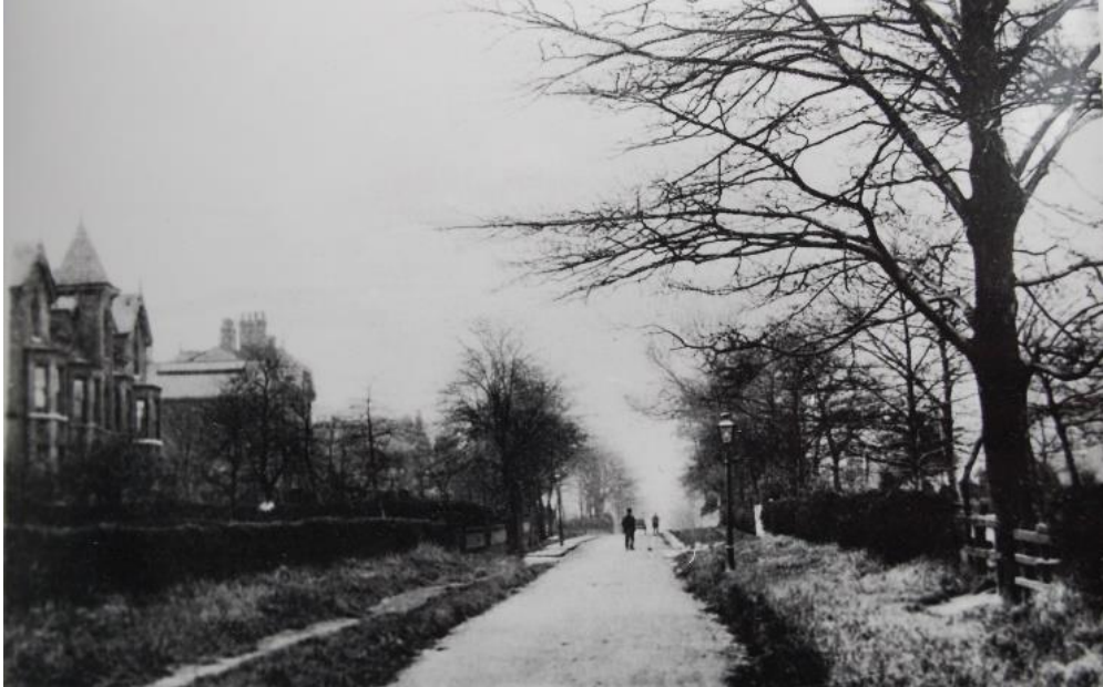
Stafford Road 1900

The terrace of three impressive Victorian houses on the left hand side in the photograph 'Stafford Road 1900' are fortunately still with us. From census records we can see that they were all occupied in 1886.