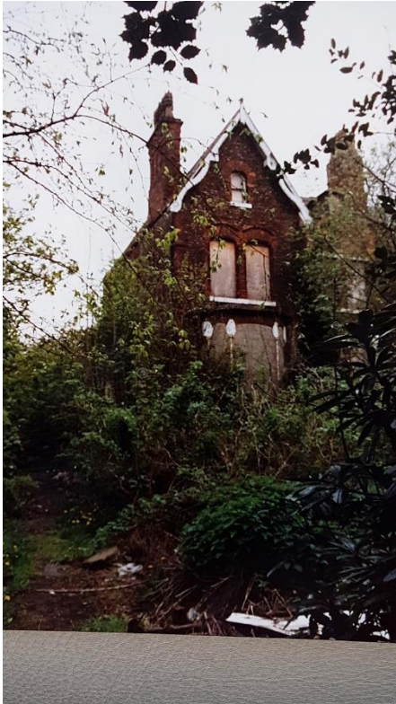
6 Victoria Road - 1990s