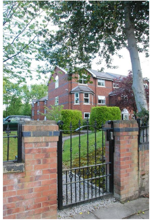
Queenscroft 2 - 2020

I vaguely remember that a very large tree fell against the side elevation of the right-hand semi, no. 4. I would be interested to know if anyone else can remember the tree leaning against the side of the house?