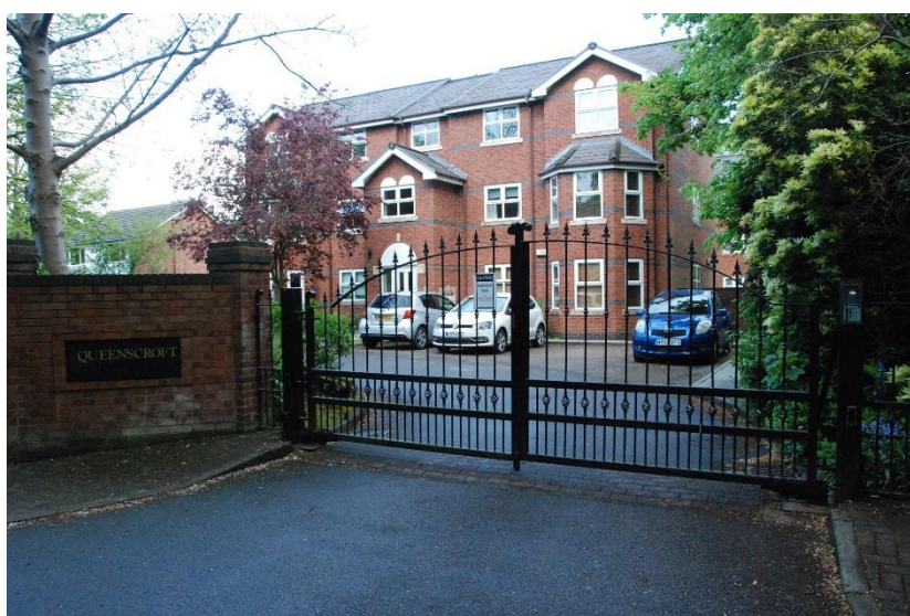
Queenscroft 1 - 2020