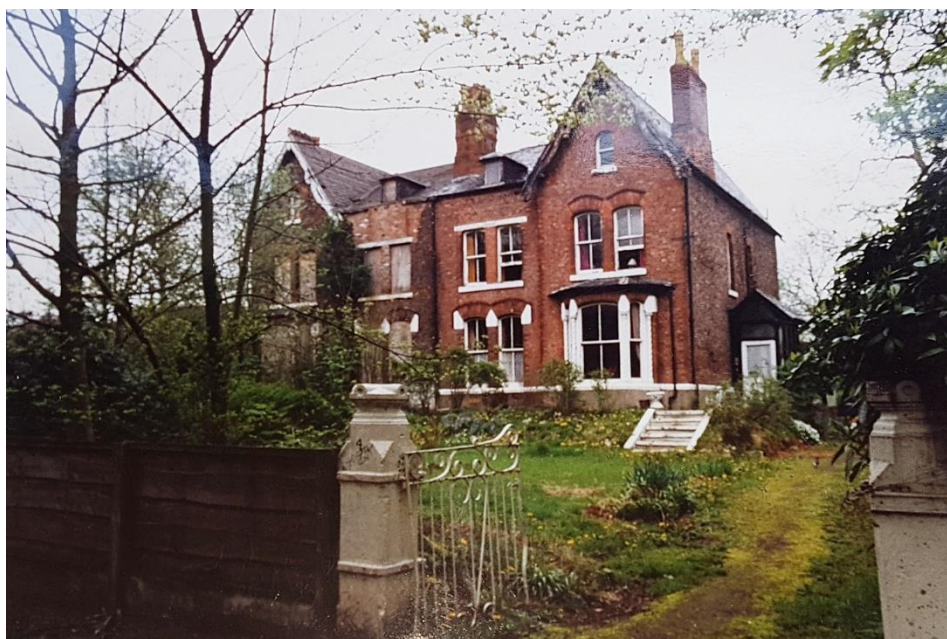
4 Victoria Road - 1990s

The photographs were taken by her daughter as part of an art project while she was a student at Eccles College. I have indicated on the map the location of these properties. These houses were eventually demolished and the Queenscroft apartment complex was built on the site. The photographs Queenscroft 1 and 2 were taken from the same view point as the photographs of 4 and 6 Victoria Road.