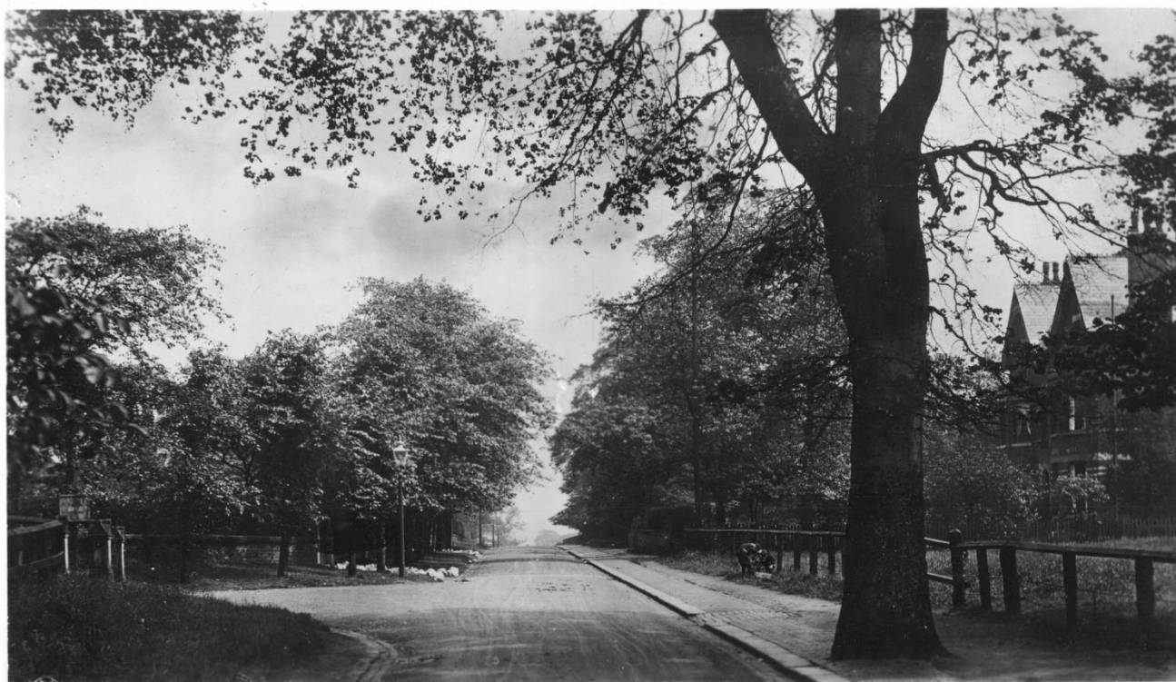
CAVENDISH ROAD, ELLESMERE PARK, ECCLES

The photograph, Cavendish Road, shows Wharton lodge on the right, next to the open ground with the two boys looking at something interesting. For me, what is fascinating is the opening on the other side of the road. There are two large gate posts and what appears to be a significant sign which unfortunately we cannot read. The property on the corner of this entry, next to the lamppost, is Highfield, the next house along is Norwood. This driveway eventually became Bedford Road which now leads to Ravensdale Gardens. The site of Highfield and Norwood was developed as the Mistral Court apartments.