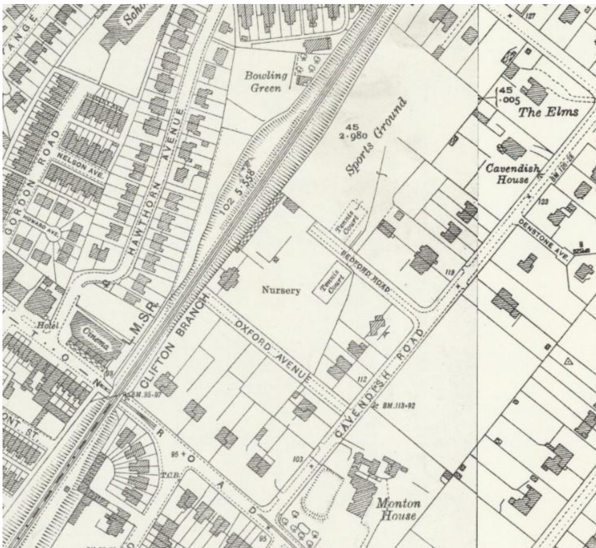
Map of Cavendish Road 1936

On the 1936 map the driveway has now been named “Bedford Road”. The Sports Ground is still identified, but now with one tennis court, the identification of a ‘Nursery’ reappears, this time with a tennis court shown.