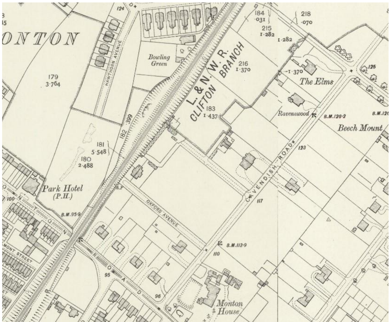
Map of Cavendish Road 1908

The 1908 map still shows an enclosure at the end of the driveway but it does not identify it as a nursery. This map also shows a rectangular enclosure in what is now field number 183.