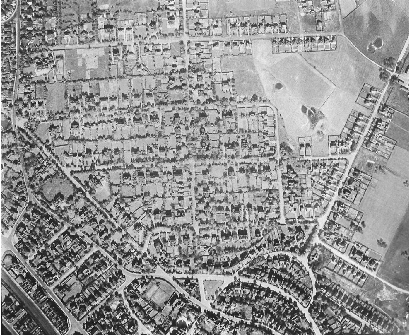
Aerial Photograph of Ellesmere Park 1943

In the EPRA archive we have two wartime aerial photographs, we understand that these were taken to assess the bomb damage in the area. We believe the date of these photographs is 1943.